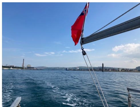
Serenity Leaving Larne.

Thursday 1 st July 2021, High Water Larne: 1730 hrs. Taking advantage of the afternoon flood tide we brought Serenity alongside Wymers Pier for ease of victualling. All stocked up, inflatable dinghy attached to the davits and two bicycles secured to the deck, we set off for our first scheduled stop in Redbay just as the tide was turning.