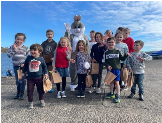
The Easter Bunny visiting EABC for our Easter Fun Day!