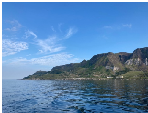
Rounding Garron Point.