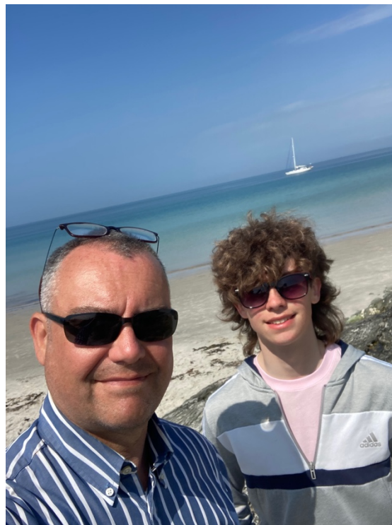
The Twin Beaches, Gigha.

I had been to Gigha previously but hadn't seen much of it other than the Hotel for dinner; this would come later along with a surprise for Joshua. We cycled as far north as the road allowed, about four miles, and stopped on our way back at the Twin Beaches, with its white sands blue sea and sky it was almost Caribbean like.