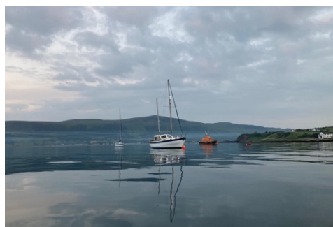
Serenity, Red Bay mooring.

Friday 2 nd July, High Water Larne: 0533 hrs. I woke early the following morning at 0400 hrs to catch the next ebb tide, it turns north an hour early in the bay I had been informed, and leaving Joshua to sleep in his bunk as this passage was expected to take 6 hours.